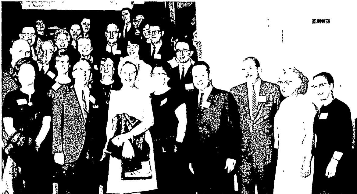
BRANDON COLLEGE ALUMNI ASSOCIATION, OTTAWA CHAPTER - APRIL 5, 1966